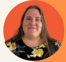
Ms Riley Year 3 Teacher

Tip 3 - Read with your child! Whether you're listening to them read aloud when they are in primary school or starting a family book club when they are in secondary school, your involvement is crucial. Children are keen observers, when adults actively engage with books, children are inspired to do the same. Share your own reading journey with them and watch as they grow to love it too!