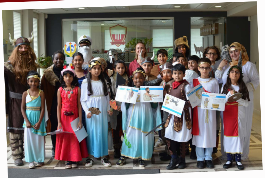
The Horrible History Show

The pupils, as well as the teachers, shared their findings about their chosen characters and presented their costumes with flair and attention to detail. We had had a great laugh and plenty to discuss when the Greeks met the Vikings!